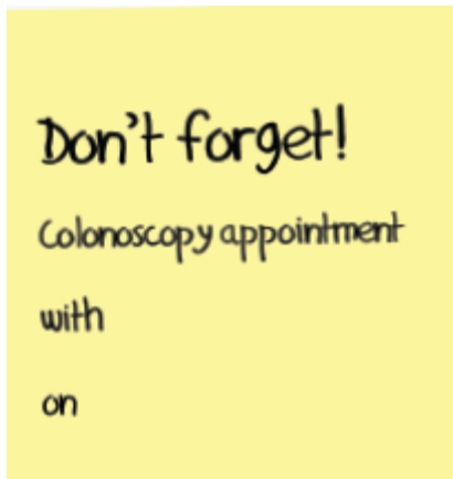
Figure 2. Experimentally varied reminder mailers sent to study participants.